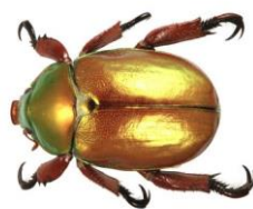
A Christmas beetle

The leaf was inspired by Australia's only cold climate winter-deciduous tree, a small Beech tree that grows in Tasmania. This beech is part of the Fagaceae family of trees, which includes oak trees, so Gaye chose oak leaves as her model for the leaf because of their interesting shape. Beetle was inspired by Australia's famous Christmas Beetle, part of the huge scarab beetle family.