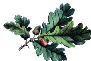
Oak leaves and acorns