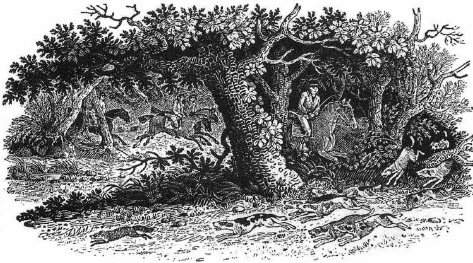
An illustration by Thomas Bewick, including an oak tree like the tree in Leaf Stone Beetle